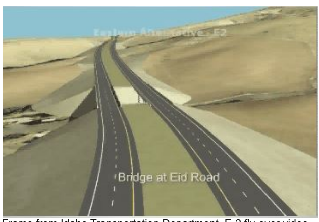
Frame from Idaho Transportation Department E-2 fly-over video

We will be watching for the Corps' decision on the Clean Water Act permit application.