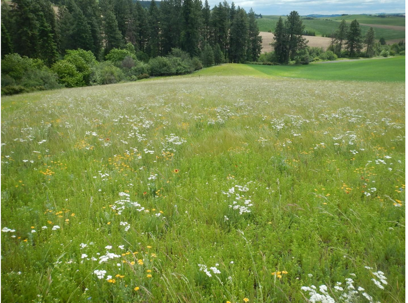
Figure 3: The project in year two (2019).