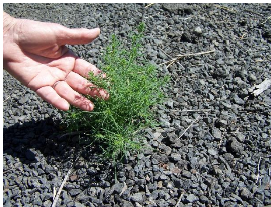
Figure 2 Young Russian Thistle plant

Russian thistle has three characteristics that can be exploited in the management of this invasive plant. First it is a poor competitor and is often replaced by other vegetation after a few years of dominance. Thus, it is important to minimize soil disturbance and to maintain the health of desirable species. Russian thistle seedlings are not only poor competitors but lack vigor and are vulnerable to herbicides when small. In addition, Russian thistle seeds are not persistent, with over 90% germinating or decaying in the soil in the first year. Thus, eliminating plants when they are small and preventing seed production in the plants that escape spring control measures are the keys to Russian thistle management.