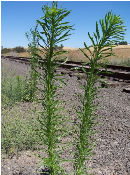
Figure 3 Mature marestail plants

Marestail or Canadian horseweed (Figure 3) is a native forb that can be considered both a summer annual and a winter annual with seed germinating at any time with sufficient moisture and warmth. In the winter version, the seed germinates in the fall and overwinters as a rosette. (photo 4) It grows rapidly in the spring and flowers in mid to late summer. The summer annual form germinates in the spring and produces young plants in late summer to fall.