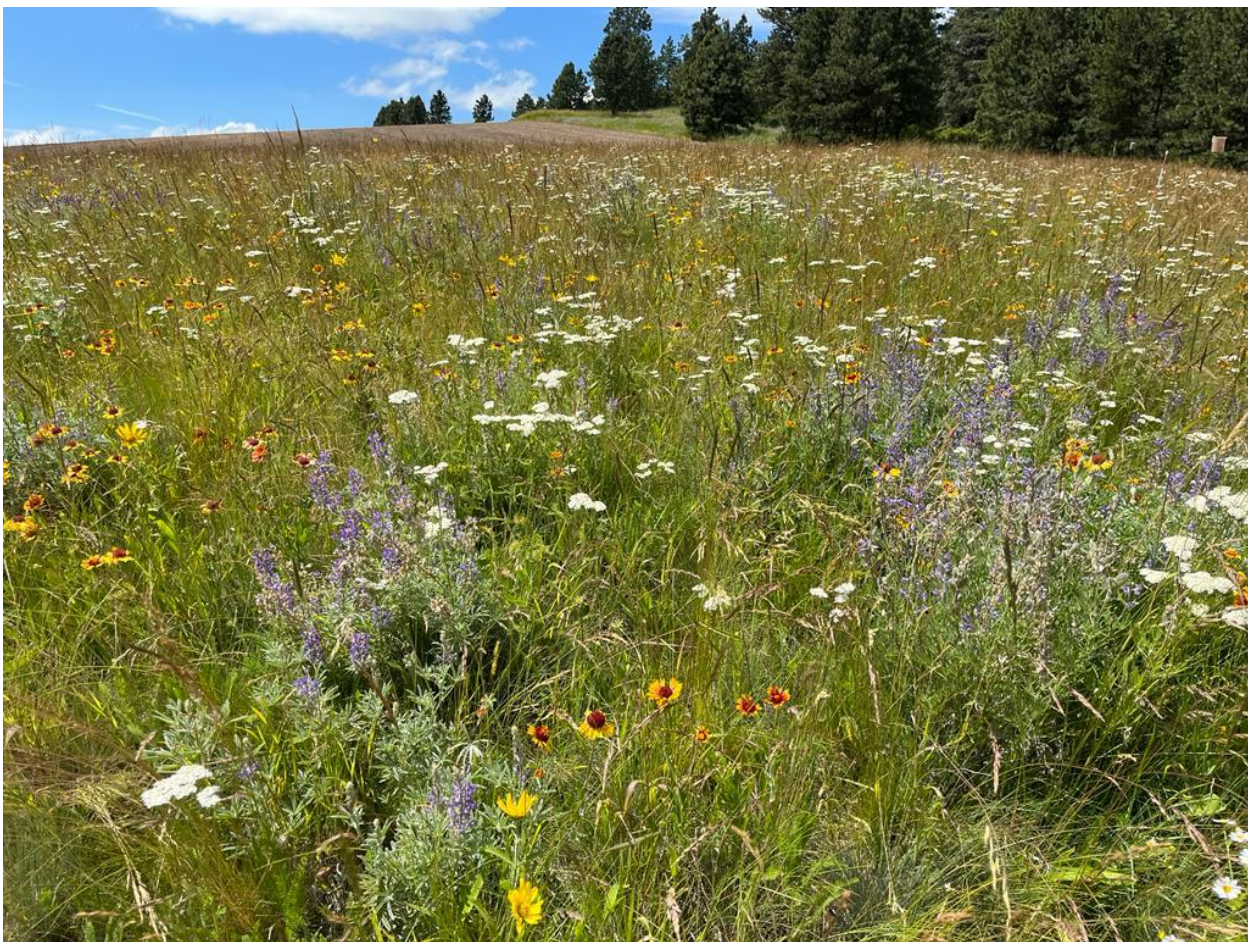
Figure 5: The project in year five (2022).

On the plus side, our prairie project has lush growth of many Palouse prairie plant species. (Figure 5) Each year has been better, and this year it was a sea of flowers and bunchgrasses, humming with pollinators all summer. Western bluebirds and tree swallows nested in our yard for the first time since 1986. Next year, we're hoping to see the first flowering of the hundreds of arrowleaf balsamroot and fern-leaf lomatium that have been growing larger year-by-year. The prairie reconstruction project is our year-round 'happy place' where a walk always brings joy!