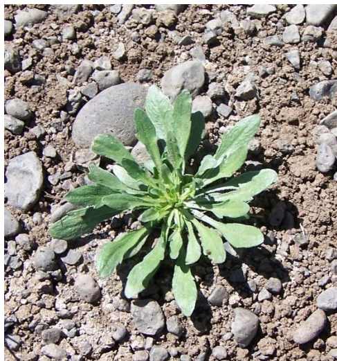
Figure 4 Marestail rosette

Control efforts will be most helpful if applied in both the spring and fall. Small infestations of Canadian horseweed can be controlled by pulling. Continual mowing prevents seed production and will eventually exhaust the plant however decapitated plants produce multiple stems if cut only once. Tillage and winter