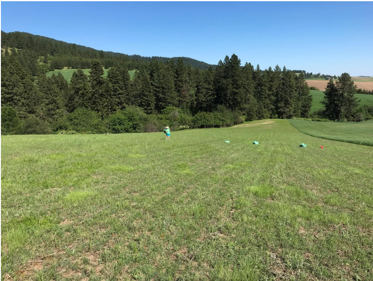
Figure 1: The project in year one (2018), after mowing to prevent weeds from seeding.

On September 1, 2017, my neighbor kindly hauled his 30' wheat drill over to our place, loaded it with a mixture of the seeds of 23 native Palouse prairie grasses and forbs, and started to plant. Because of the size and fuzziness of the seeds, he recruited his son to walk back and forth on the drill to break up seed dams. Eventually, over several passes in different directions, most of the seed was in the ground, and our prairie reconstruction project was underway. Thus began an adventure that has been variously exasperating, exhausting and frustrating, but also exciting and occasionally highly rewarding.