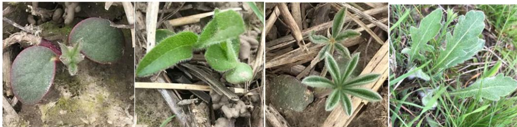
Figure 2: Emergent seedlings in year one (2018).

We had been warned to expect slow progress the first couple years, but even in year one we were encouraged by the germination and emergence of hundreds or thousands of seedlings. (Figure 2)