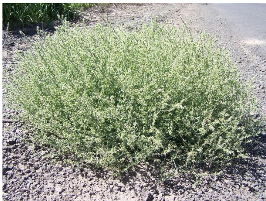
Figure 1 Mature Russian Thistle plant

Prickly Russian thistle ( Salsola tragus ) is an annual forb that reproduces by seed. It is native to arid and semi-arid ecosystems in southeastern Europe, central Asia and northern Africa. Early in its development Russian thistle leaves are long and threadlike and it looks like a pine tree seedling. As the plant matures it develops long branches with small greenish or purplish flowers and spiny leaves that form a bushy, tumbleweed shape. The 3 foot by 6 foot plant can have roots that extend 6 feet down but as the plant matures specialized cells at the base allow it to break free from the base and spread seeds as it tumbles with the wind. (Figure 1)