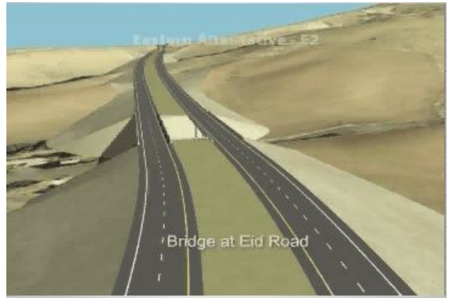
Frame from Idaho Transportation Department E-2 fly-over video

We will be watching for the Corps' decision on the Clean Water Act permit application.